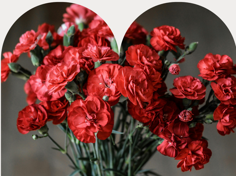
COMBINED RICHMOND & REFLECTIONS

SEATED 350 PAX HALF DAY - $295 FULL DAY - $395 Elevated mezzanine, dancefloor, private bar & AV facilities