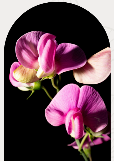
THE 1948 LOUNGE

LEVEL 1 30 PAX HALF DAY - $70 FULL DAY - $110 Semi-private space with room to overflow into the lounge